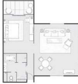
One Bed Room Suite