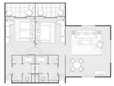
Two Bed Room Suite